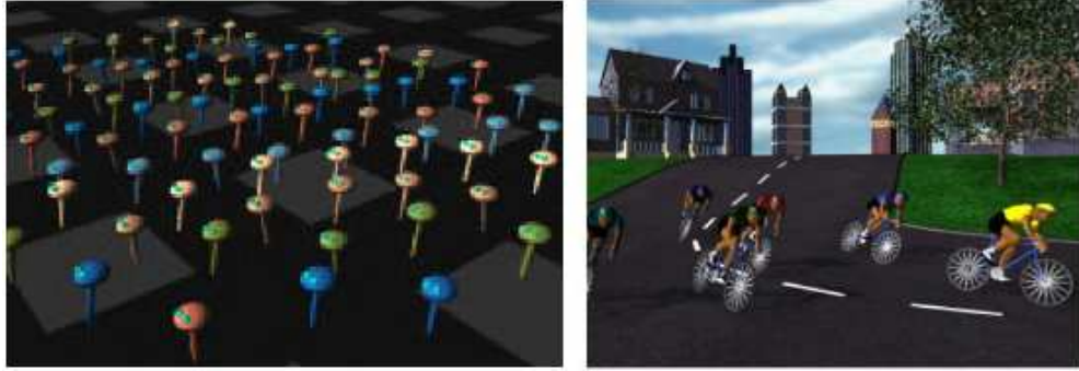
Figure 1: Images of 105 simulated one-legged robots and 6 simulated bicycle riders.

must have a wide variety of complex and interesting behaviors and must be responsive to the actions of the user. The difficulty of constructing such synthetic characters currently hinders the development of these environments, particularly when realism is required. In this paper, we describe one approach to populating graphical environments, using dynamic simulation to generate the motion of characters (Figure 1).