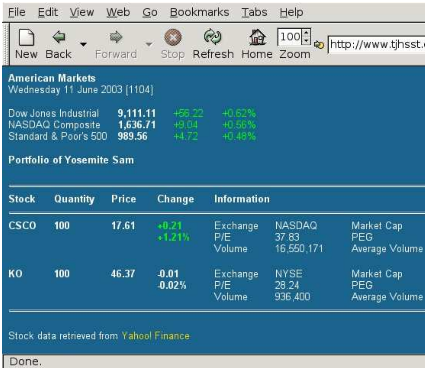
Figure 3. Yosemite Sam's portfolio.