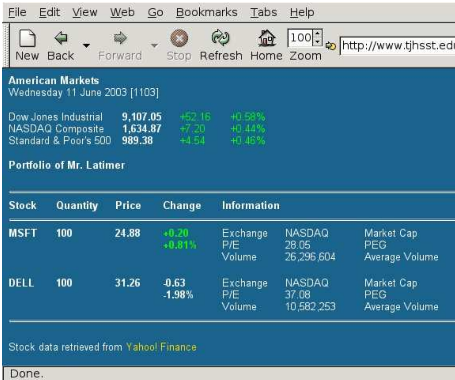
Figure 1. Mr. Latimer's portfolio.