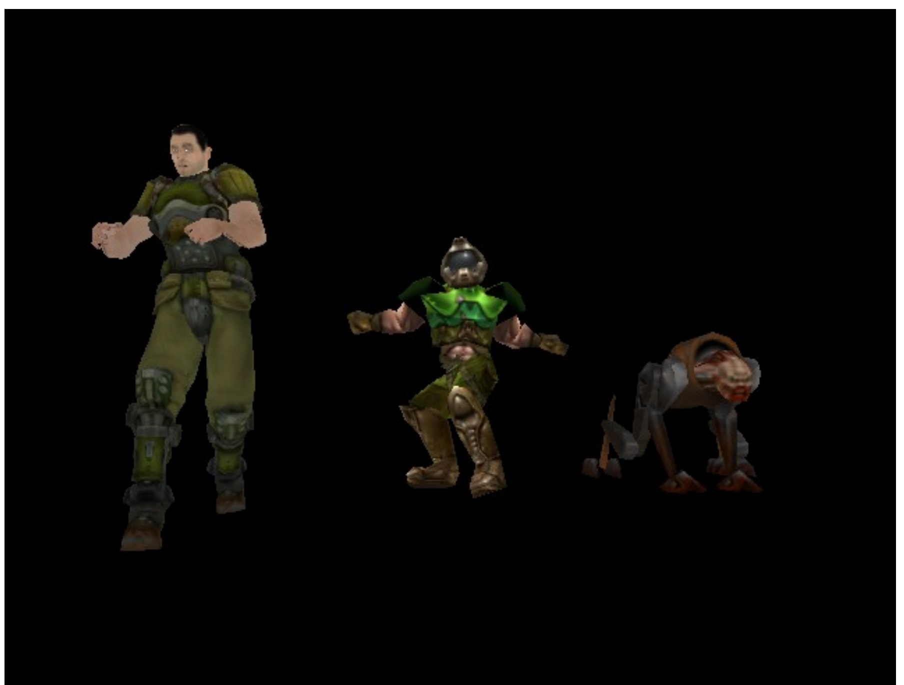
Rendering and animating meshes in 3 formats