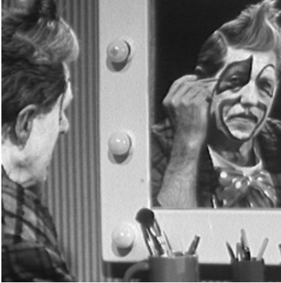
Figure 1: Original Image