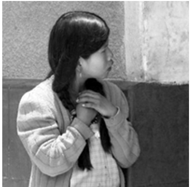
Figure 3: Image resized by pixel replication

until the end of the year, and create a functioning algorithm that can even be built off of in future research.