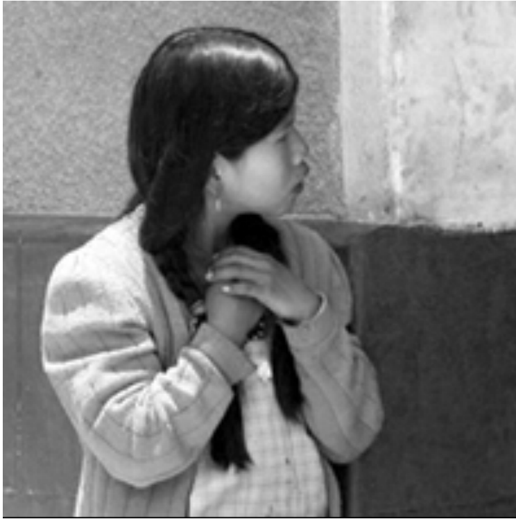
Figure 4: Image resized by interpolation