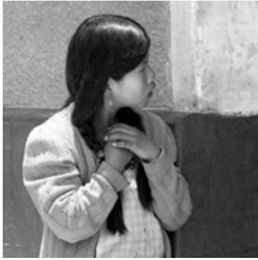
Figure 2: Original image