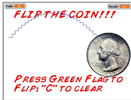
Figure 2: The completed code for the coin flip program

standing. Apart from the Scratch-related problems, Kindergarten students have a notoriously short attention span, which means that lessons must be short, visually appealing, and must grab the attention of the student immediately. Even with these issues, it is still rewarding for both the class and the instructor when the students are able to memorize, understand, and apply concepts from either math and programming. A five-question quiz that I gave the students to see how well they understood various pieces of code ended with an average score of three, which was decent given some of the more difficult questions. There were a few zeros that I did not understand from the students, so I asked how many quizzes they had taken that year. It turns out that this was the first quiz they had ever taken. Given the fact that this quiz was their first, and was noticeably difficult for them, an average score of three was more than acceptable. Throughout the year, I have attempted teaching math both through the Scratch program and through normal lessons. While hands-on activities always seem to work best, the students always understood a math concept better after seeing it demonstrated in Scratch, thus confirming my theory that Scratch is excellent for teaching in fields other than programming, even for young students.