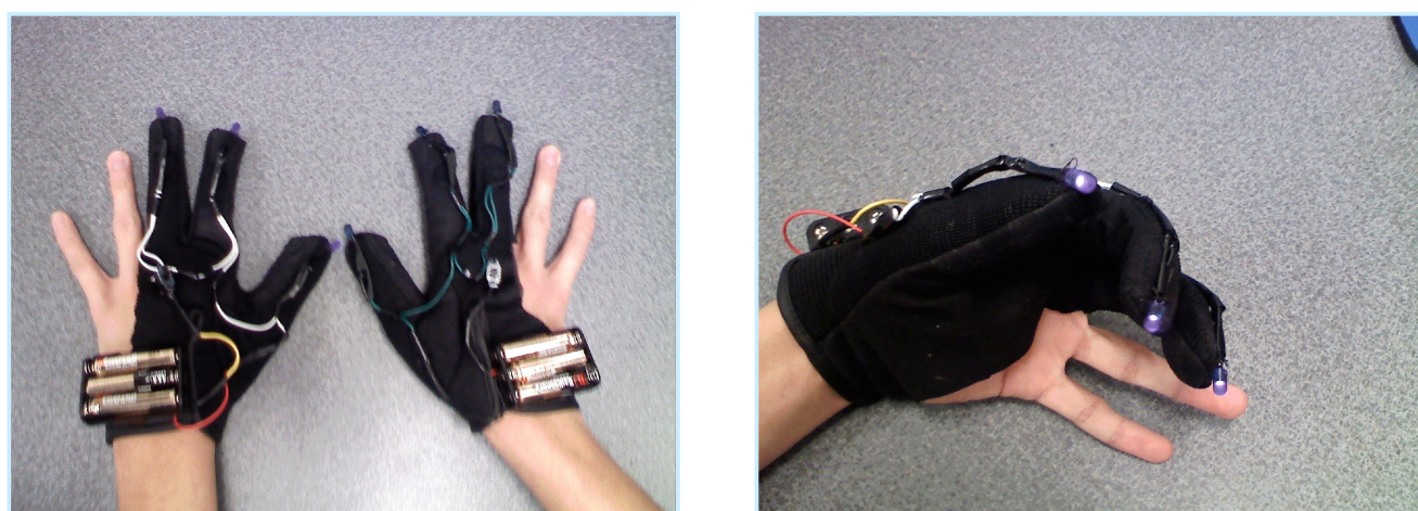
Fig 1. IR LED Glove Final Version

The user wears two gloves, each containing three 950nm IR LEDs on the fingertips. The gloves are wireless and are powered by three 1.5V AAA batteries.